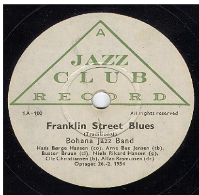
Haandstad's only result being a record producer.

See See Rider, Dippermouth Blues, Breeze, Weary Blues, Home Sweet Home and Panama Rag.