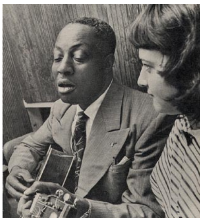
Big Bill Broonzy with unknown admirer, Club Montmartre, Copenhagen in May, 1956.