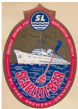
The very popular "Scarlett-Beer" manufactured by Faxe Breweries was served aboard.