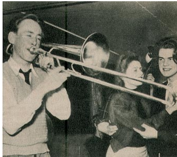
Chris Barber blows aboard a Scarlett ferry boat cruising in the waters between Denmark and Sweden. These trips, called "Riverboat Shuffles" were very popular in the early 1950's.

Around in London and the suburbs there are a lot of dance halls. In one of them, Orchard Ballroom, we heard Chris Barber's New Orleans Jazz Band that was so good that we repeated the acquaintance in Club Satchmo , Edgware and later at a concert at Alexander Gardens Theatre in Weymouth located by the sea at the south coast.