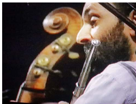
Urru in a close-up mix.