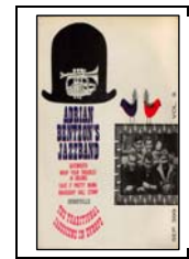
Storyville EP, SEP 399