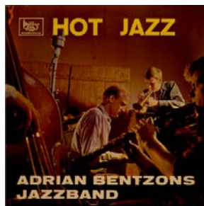
Storyville EP, SEP 332