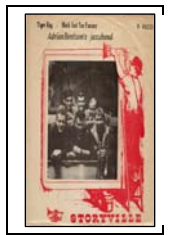
Storyville single, A 45033