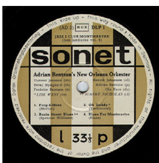
Anders Dyrup's first attempt as a record producer.

Note: *For AD 2/3 (JJ 118) see January 2, 1955 below.